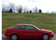
2004 Volvo C70 Convertible. $21,650, red, leather interior, 41,000 miles