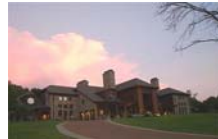
5 Bedroom, 5 Full Bathrooms, Located in Nashville, TN MLS# 878100